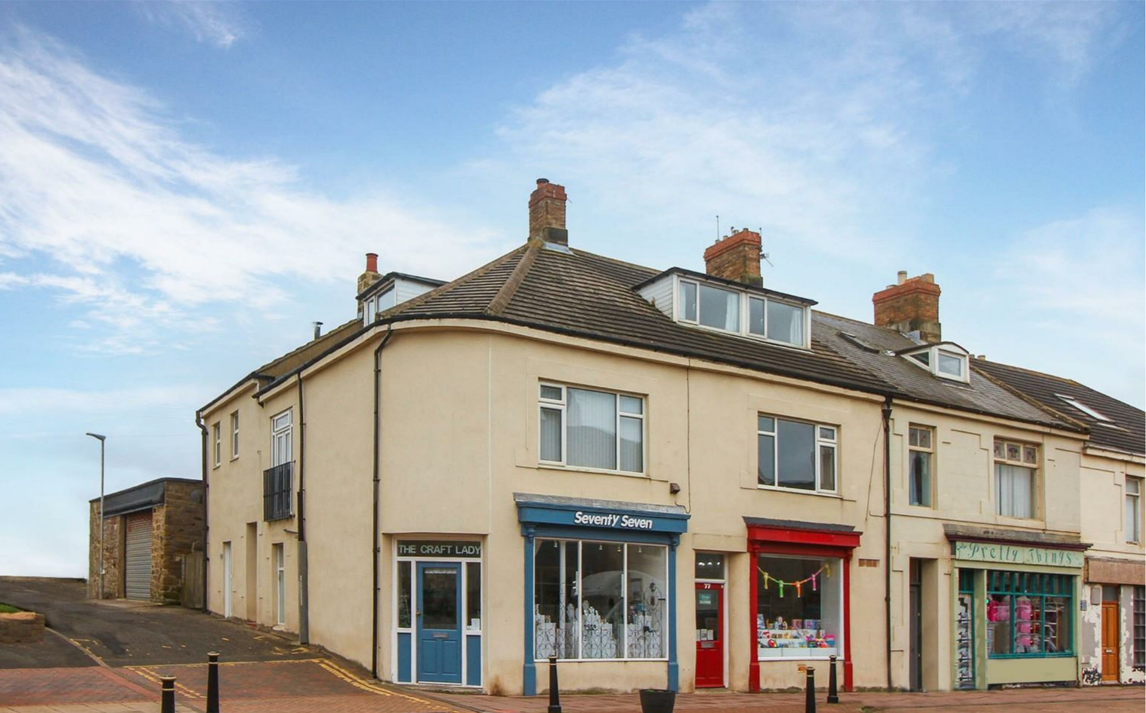
📍 Front Street, Newbiggin-By-The-Sea NE64 6AD